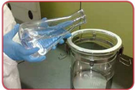
2) A A