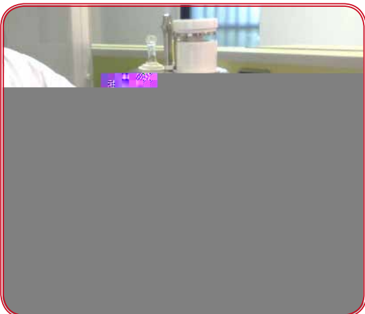
5) T A A S