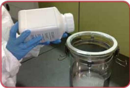
1) A A