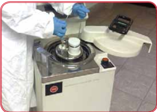
3) T A